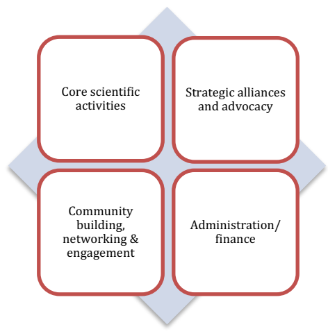
Figure 1: overview of the four operational pillars of FENS

All operational pillars, including their underlying activities are separately defined in the present Strategic Plan with definitions of detailed objectives and specific actions.